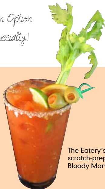
The Eatery's own scratch-prepared Bloody Mary